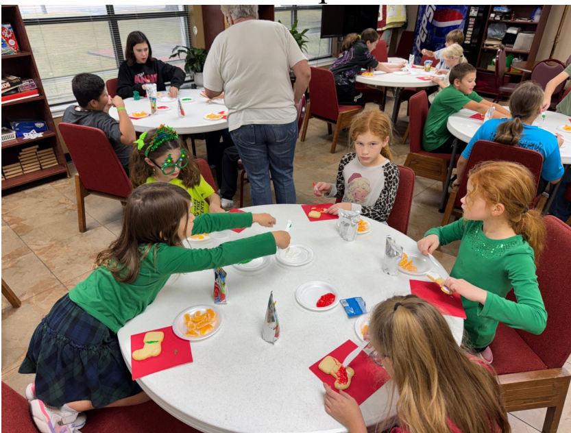
Members of Children's Fellowship celebrated their annual Christmas Party on December 17. Kids iced sugar cookies, made luminaries for Christmas Eve and went on a scavenger hunt throughout the church.