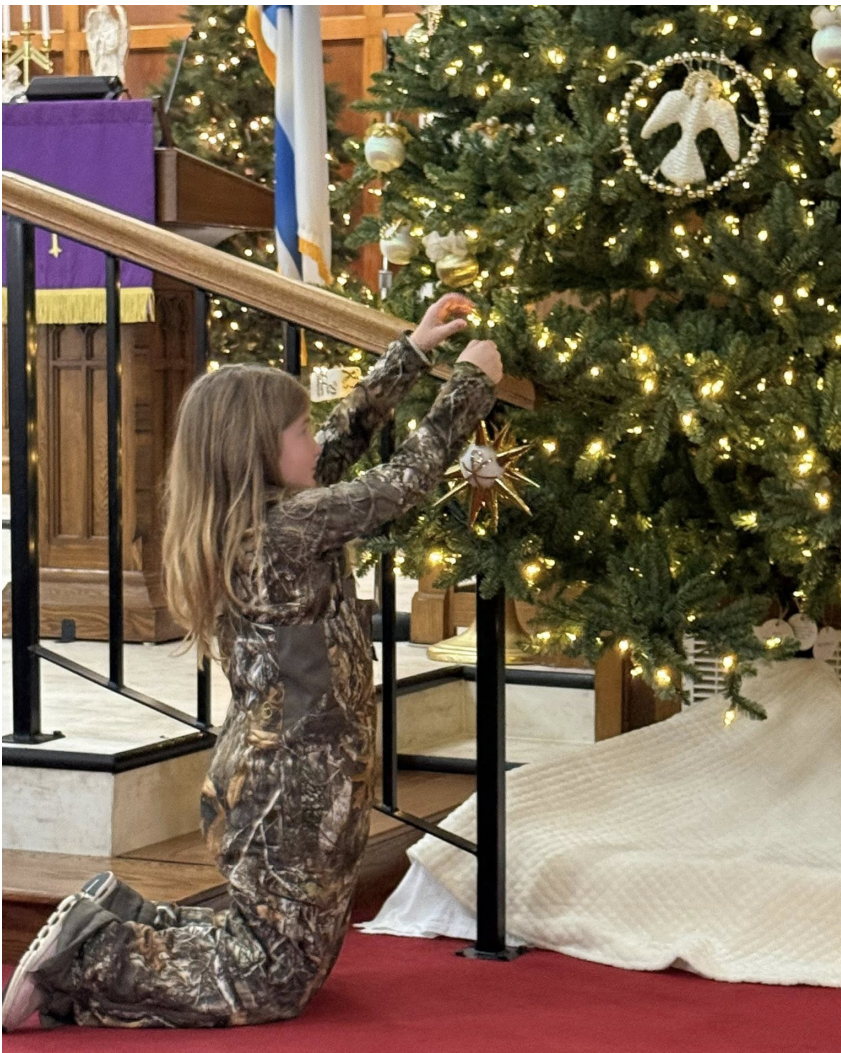
Kids from the church hung Chrismon ornaments of the sanctuary during worship during the Hanging of the Greens ceremony on November 30.