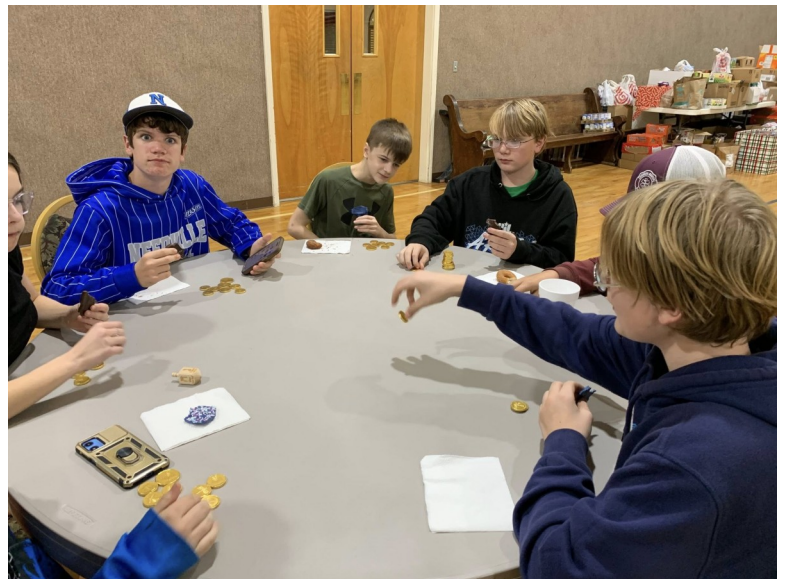
Our Jr. & Sr. High Youth Fellowship celebrated the 4th night of Hanukkah by lighting candles, playing dreidel and eating donuts.