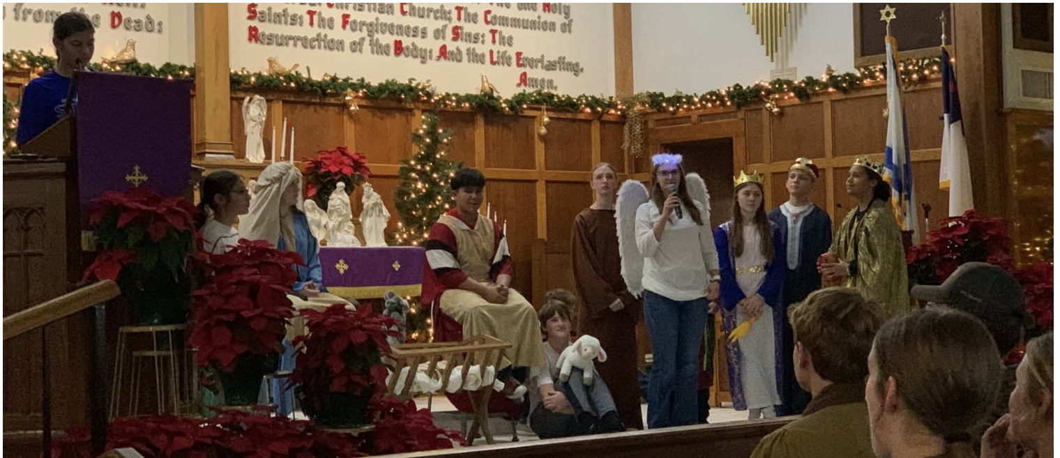
Members of our Jr. & Sr. High Youth Fellowship performed the live streaming Christmas skit "The Mismatched Nativity" on December 10.