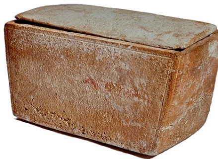
The James Ossuary

If Jesus hadn’t risen from the grave, the body would then have decomposed and a year later the family would have returned and lovingly gathered his bones that were laid out in the tomb, and placed them into a stone ossuary inscribed his name on it and placed the bone box in a small burial niche which would have contained other ossuaries of family members who were also buried there.